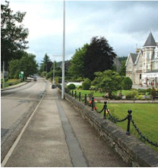
Woodlands Terrace looking towards the site of the old station, Granttown West.

Station Road, now Woodlands Terrace, runs from the road to the Kylintra lotted lands (fields enclosed in Granttown's early days, the partly artificial Kylintra Burn, the Silver Bridge and the "West End Spootie" of 1900.