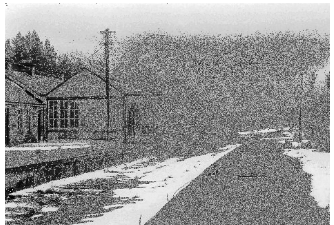
Granttown West after the Beeching cuts of 1965: a severe blow to Granttown marking the start of a significant decline in tourist numbers and the closure of several hotels.

The REME huts were almost adjacent to the station, making Granttown an important base for the repair of military vehicles. In consequence there were military checkpoints around the town including one in front of the Craiglynne.