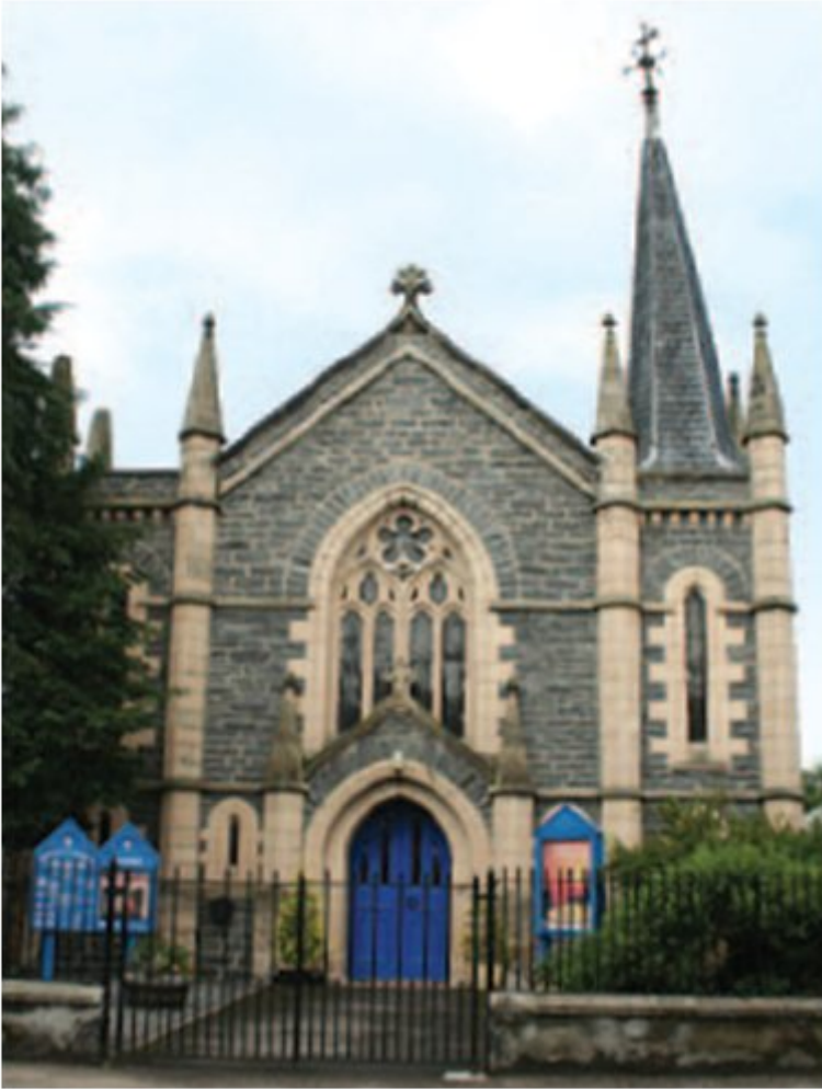
Grantown Baptist Church

The Church was established by the peacher and evangelist James Alexander Haldane who was preaching in Grantown in 1805 (at Figgat Fair when “the town was almost full of volunteers quartered there”).