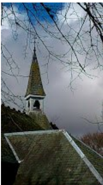
St Columba's Church

Grantown had at one time five churches. As well as Inverallan Church, the Established Church, there was also St Anne's in Forest Road and St Columba's of 1892/3 just beyind the end of the High Street. Both congregations now worship in the same building. In Woodside Avenue is the South or United Free Church dating to 1849, six years after the disruption.